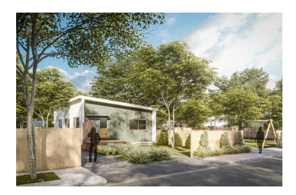
$259,358 ex yard, fixed cost

Consult our team about our comprehensive turn-key options, covering consents, delivery, installation, and connection to services.